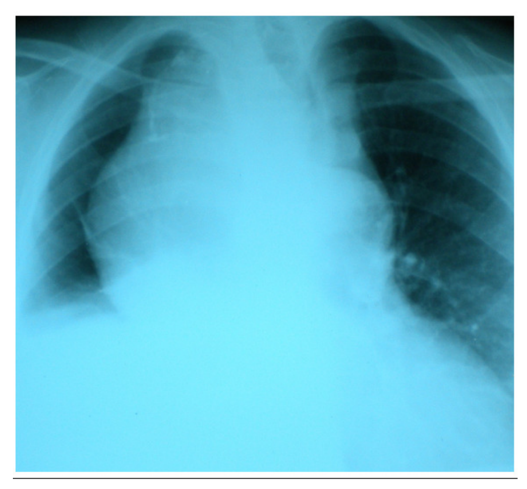
Figure 1 Chest radiograph showing a giant right mediastinal mass with tracheal shift