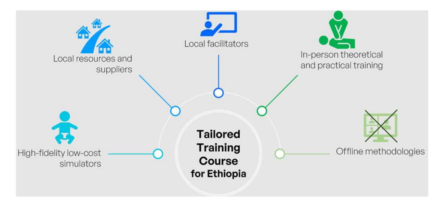
Figure 2: summary of key research findings; main features a simulation training course tailored to the Ethiopian needs should present

Figure 1: new simulator of the umbilical cord and placenta, made of silicone, with labels pointing to the main components