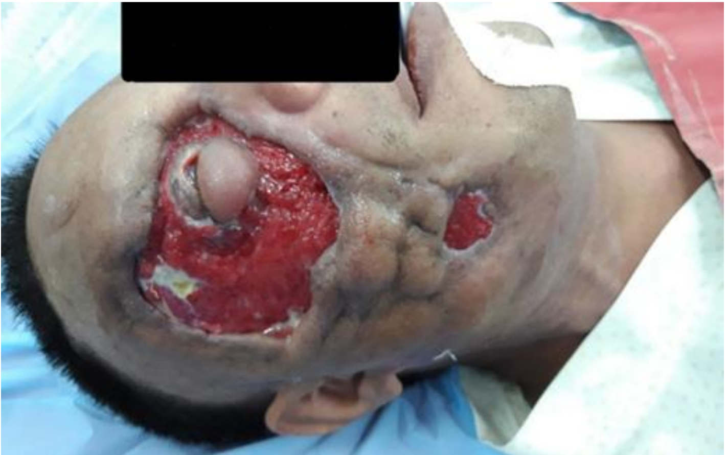
Figure 1: necrotizing fasciitis in the orbital and submandibular areas of the right face

and Tazobactam 4.5 gram I/V Q8H, injection Pantoprazole 40mg I/V x OD, injection Ondansetron 4mg x Q8H and injection tramadol 100mg in 100ml normal saline I/V x BD. Surgical intervention- debridement with complete removal of the necrosed skin. Necrotizing fasciitis is a rare illness but one that has a high risk of significant morbidity, without surgery, mortality is very close to 100%.