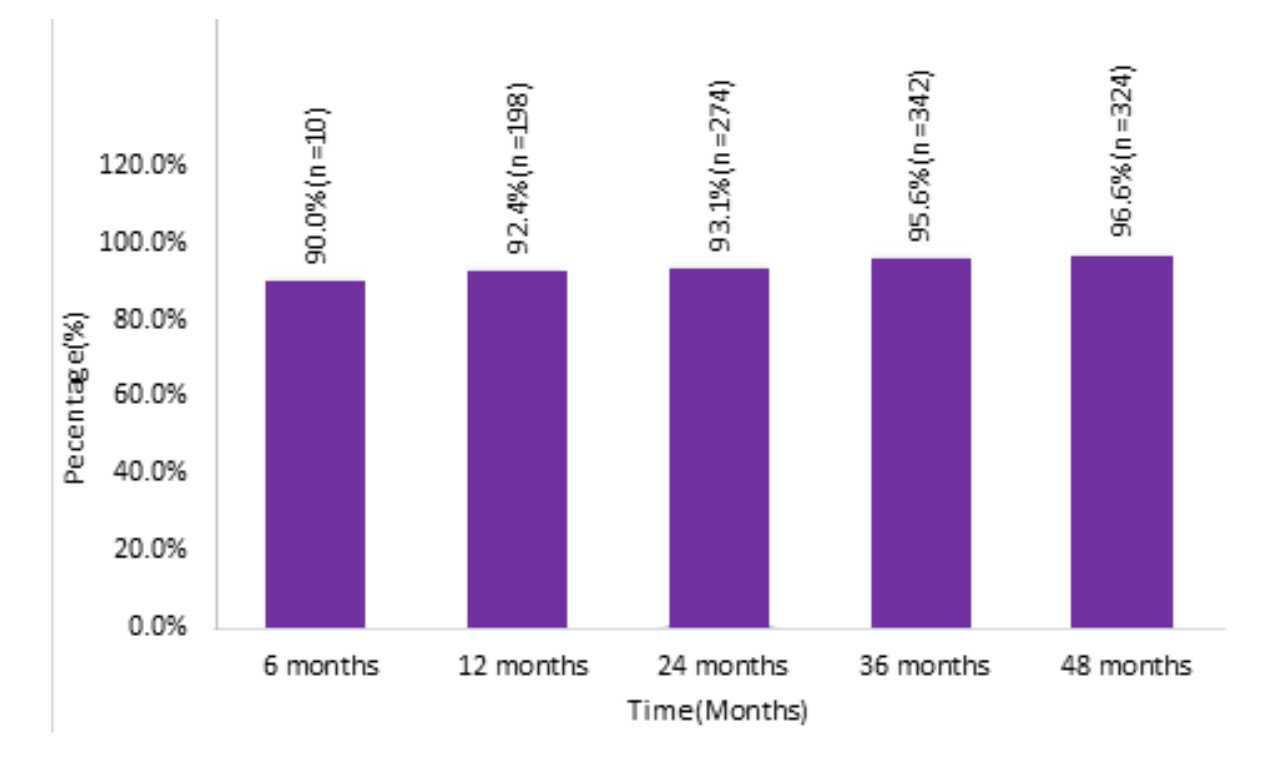
Figure 2: viral load suppression among 2014 cohort at Senkatana