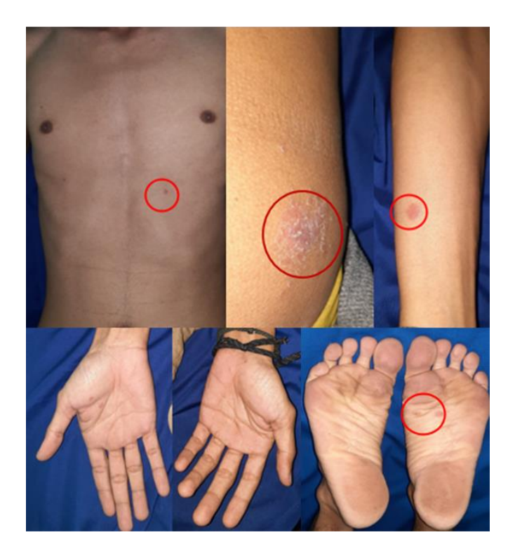
Figure 2 : the clinical manifestations on the trunk and extremities