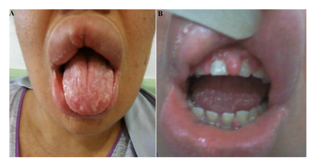
Figure 1: A) swelling of the lips with geographic tongue; B) gingival hyperplasia