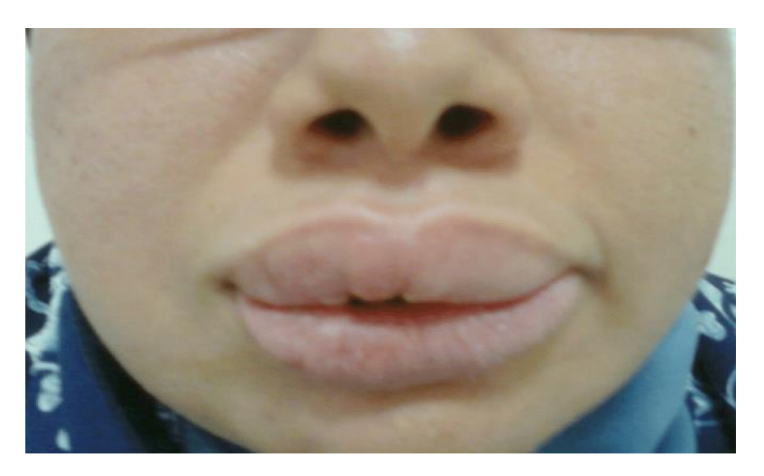
Figure 3: after treatment, residual swelling of the lips