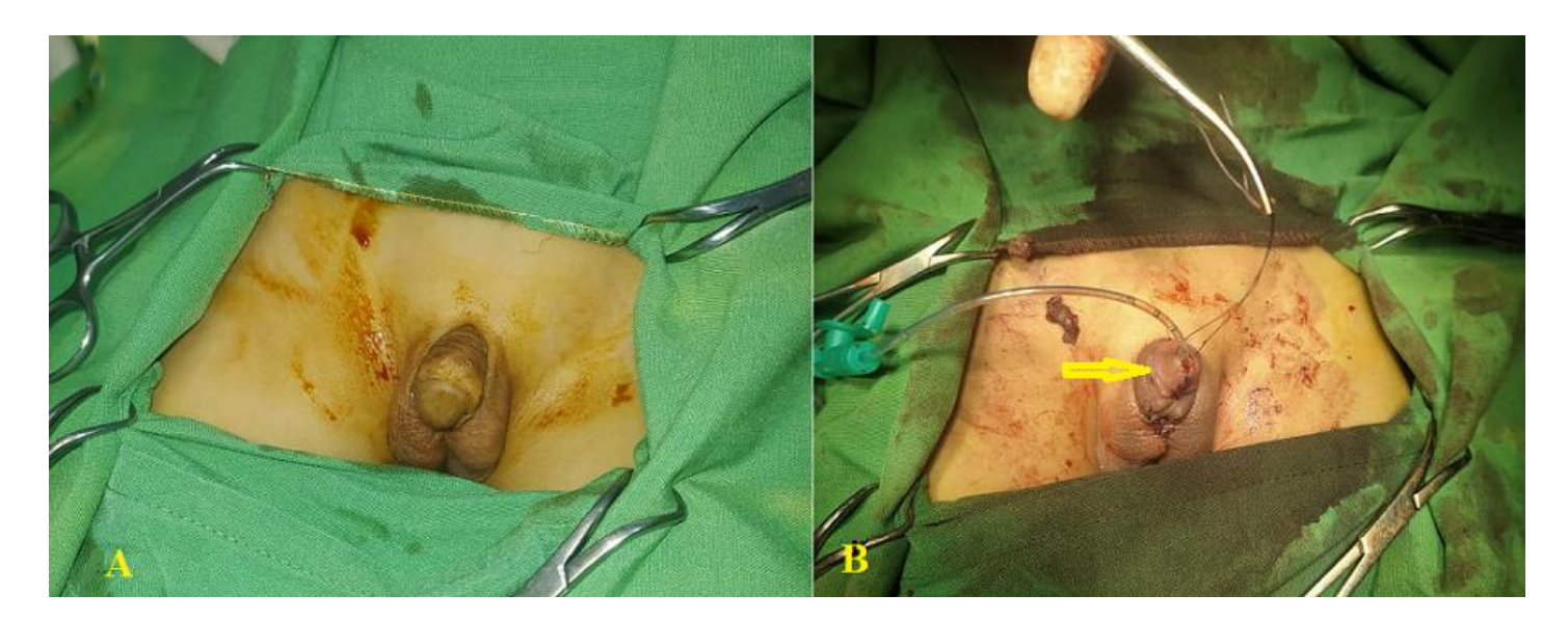
Figure 3: A) preoperative photo of penile appearance; B) postoperative photo showing the location of the meatal opening (arrow)