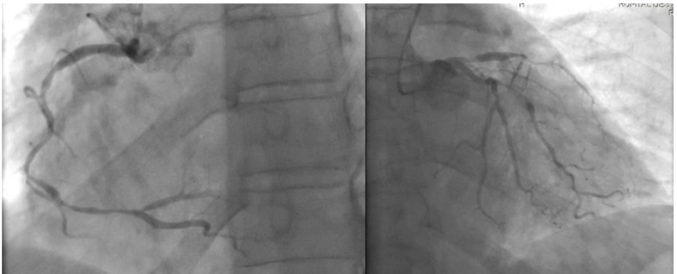
Figure 5: coronarography angiography showing multiple severe stenosis in the left and right coronary arteries