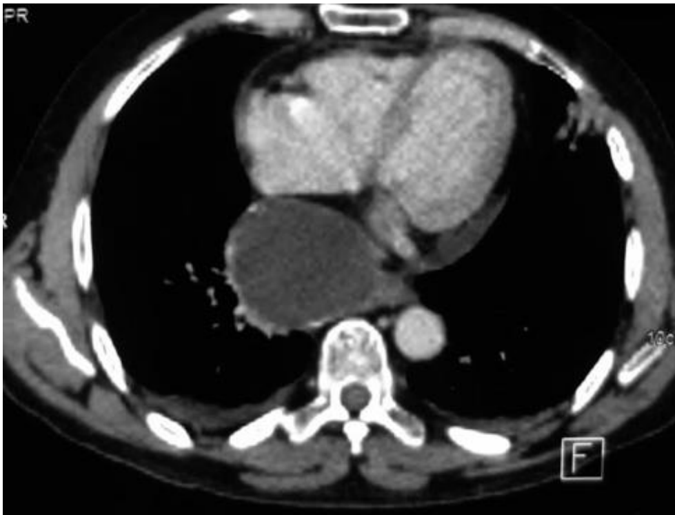
Figure 4: chest CT-scan showing pleuropericardial cyst with 79 x 66 mm at diameter