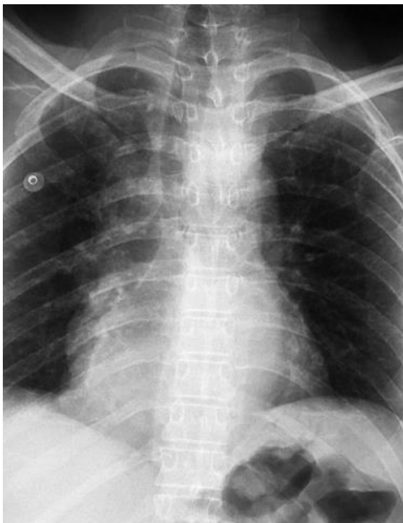
Figure 3: chest X-ray showing homogenous density in the right cardiophrenic angle and trachea deviation