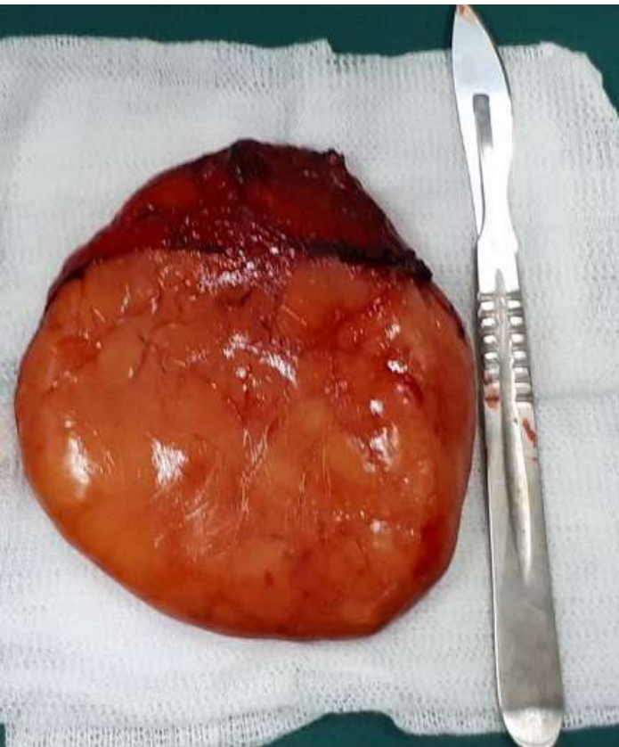
Figure 3: gross specimen