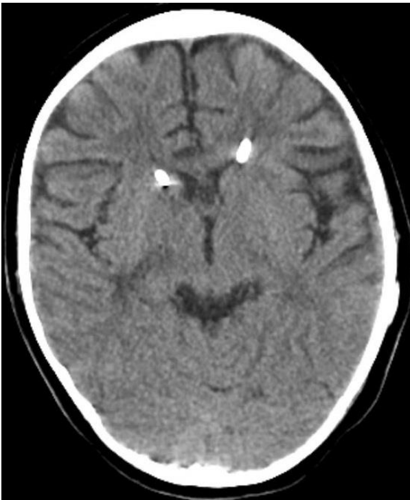
Figure 4: One year follow up CT scan showing the Catheter sin place and the normal ventricular system