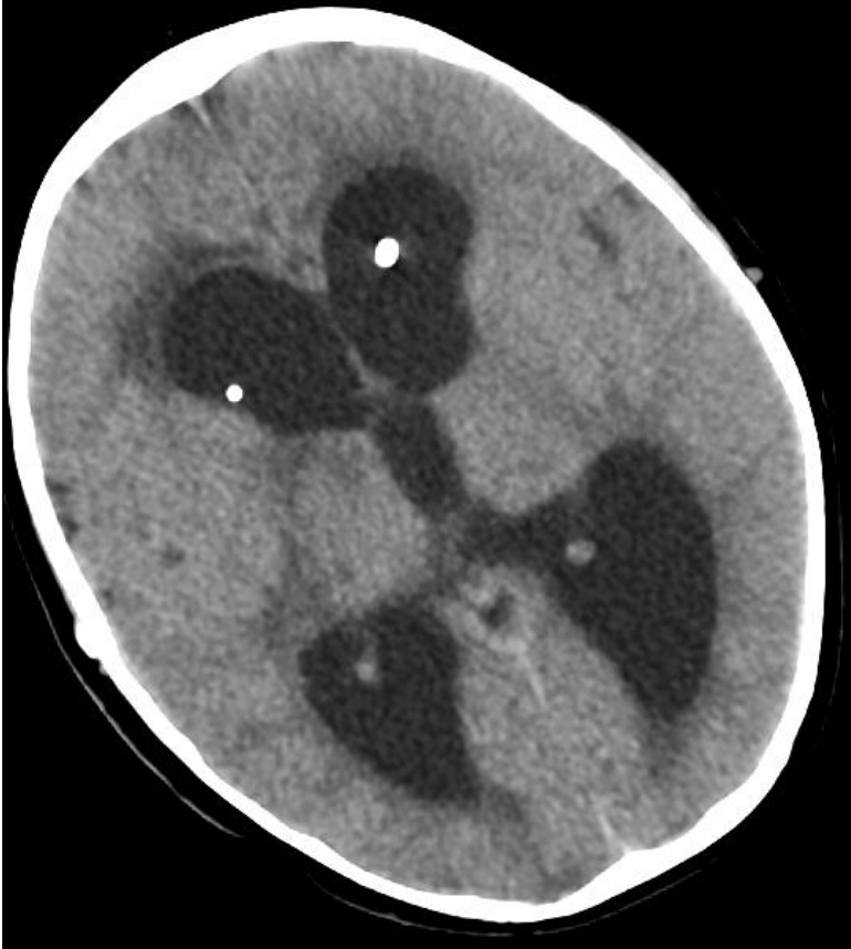
Figure 1: Preoperative CT scan demonstrating hydrocephalus