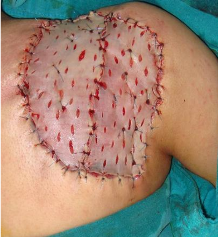
Figure 4: Coverage of the loss of substance by graft of thin skin