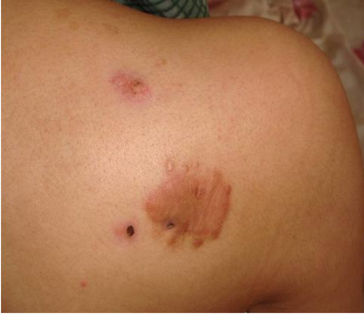
Figure 1: The two farms painless nodules and a solid plaque on the right scapular region