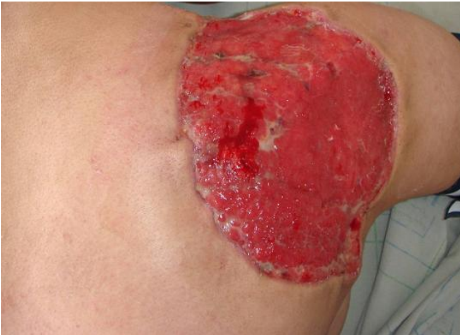
Figure 2: A loss of substance in granulation after wide excision