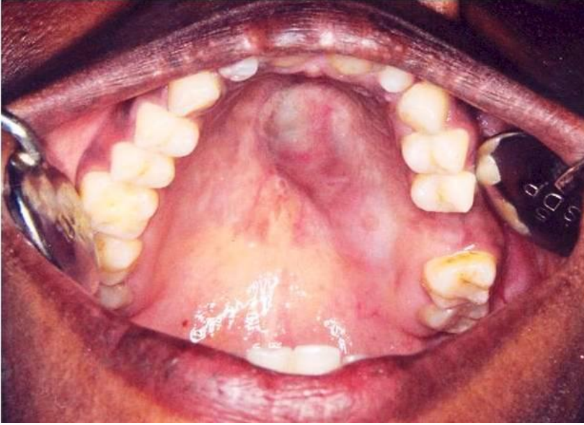
Figure 1: Intra-oral picture showing swelling extending from right central incisor to left second molar