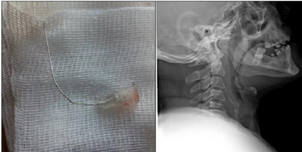
Figure 1: X-Ray and foreign body's of Case 1