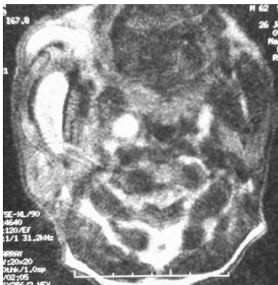
Figure 3: Cervical MRI axial FAT SAT T2 section showed abscess 40 x 20 mm of the right parotid gland (black arrow)