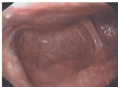
Figure 1: 10 GD showing 2 diverticula (arrows)