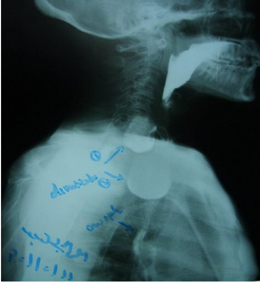
Figure 2: Barium swallow showing 2 oesophageal diverticula