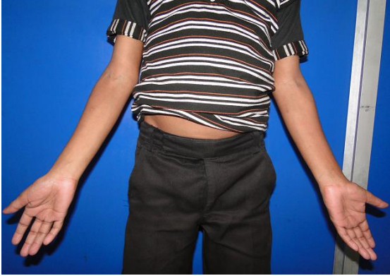
Figure 3: Photograph showing cubitus valgus deformity