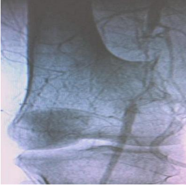
Figure 2: Pre-operative Digital subtraction arteriography showing the popliteal artery occlusion