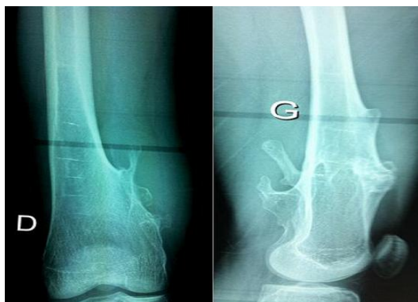
Figure 1: X-ray of the knee showing the bilateral exostoses of distal femur