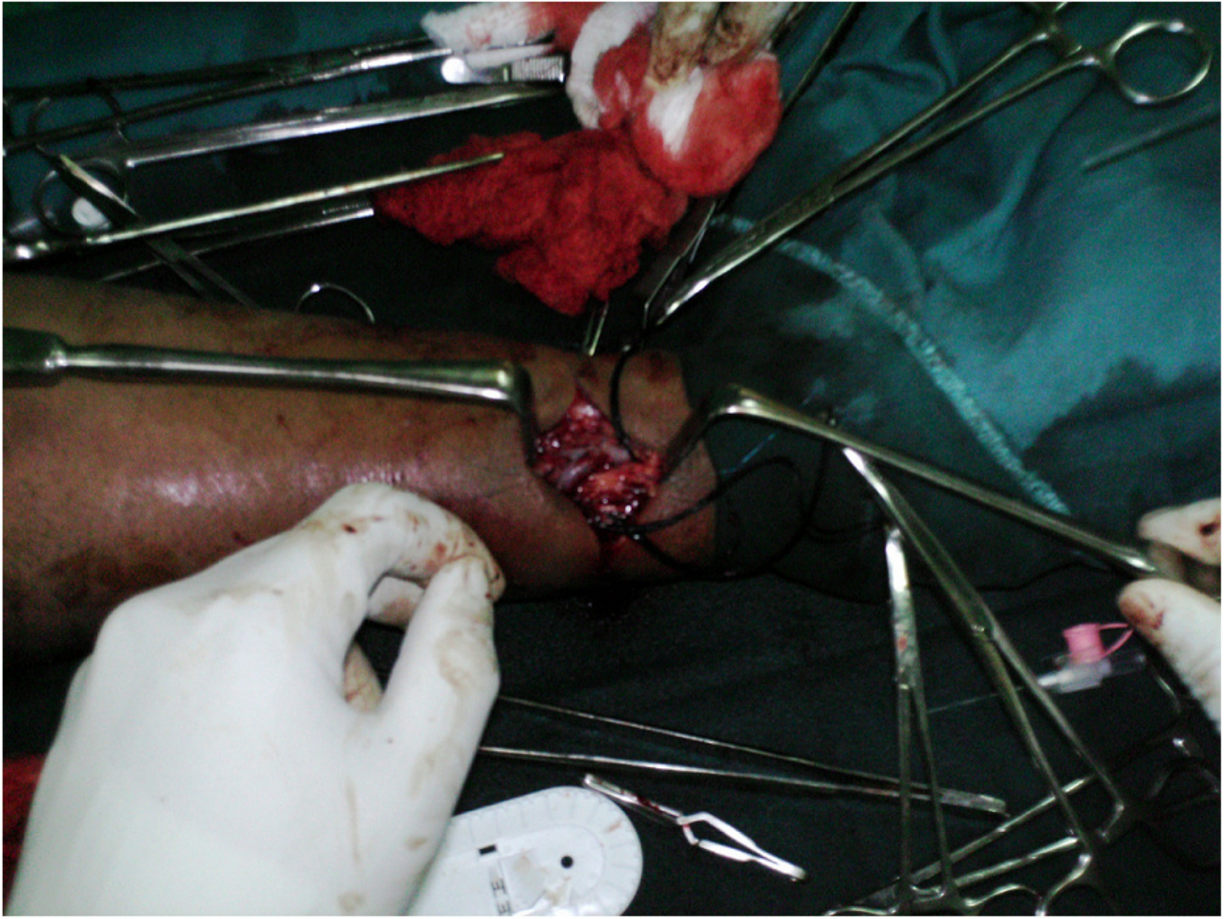
Figure 1 Our first patient to have wrist arterio-venous fistula construction; intra-op picture