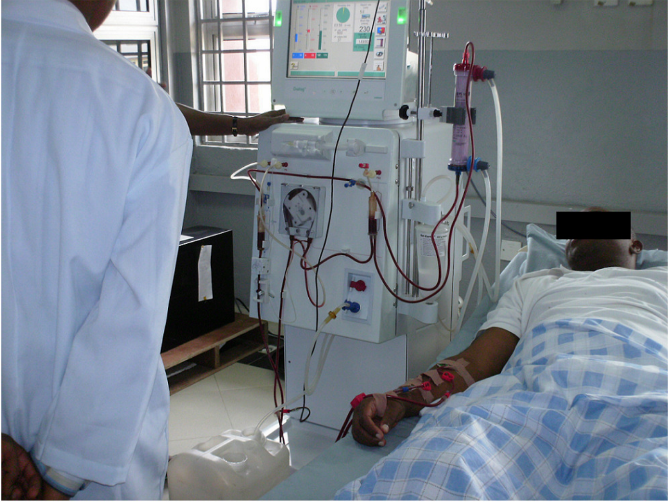
Figure 2 Our first patient to have wrist arterio-venous fistula construction; intra-dialysis picture