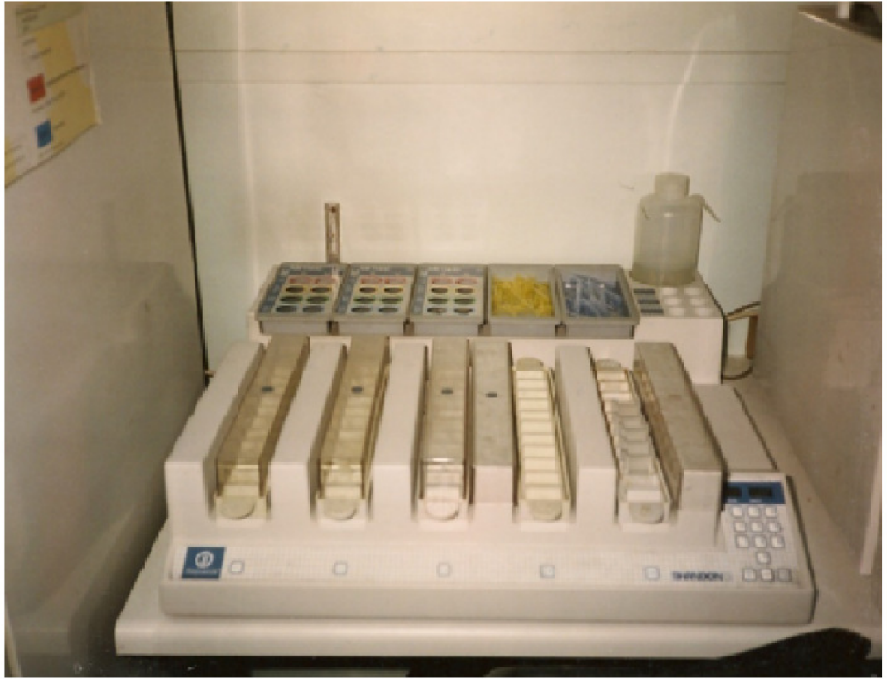
Figure 1 Shandons Sequenza Immunostaining centre