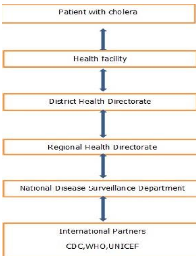
Figure 2: Flow diagram for reporting cholera cases from patient through to international partners in Osu Klottey district