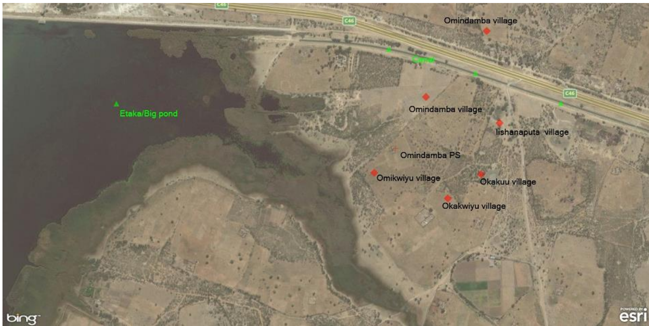
Figure 2: A satellite map showing the water canal and villages of cases in Omusati region with Schistosomiasis cases, March 2016