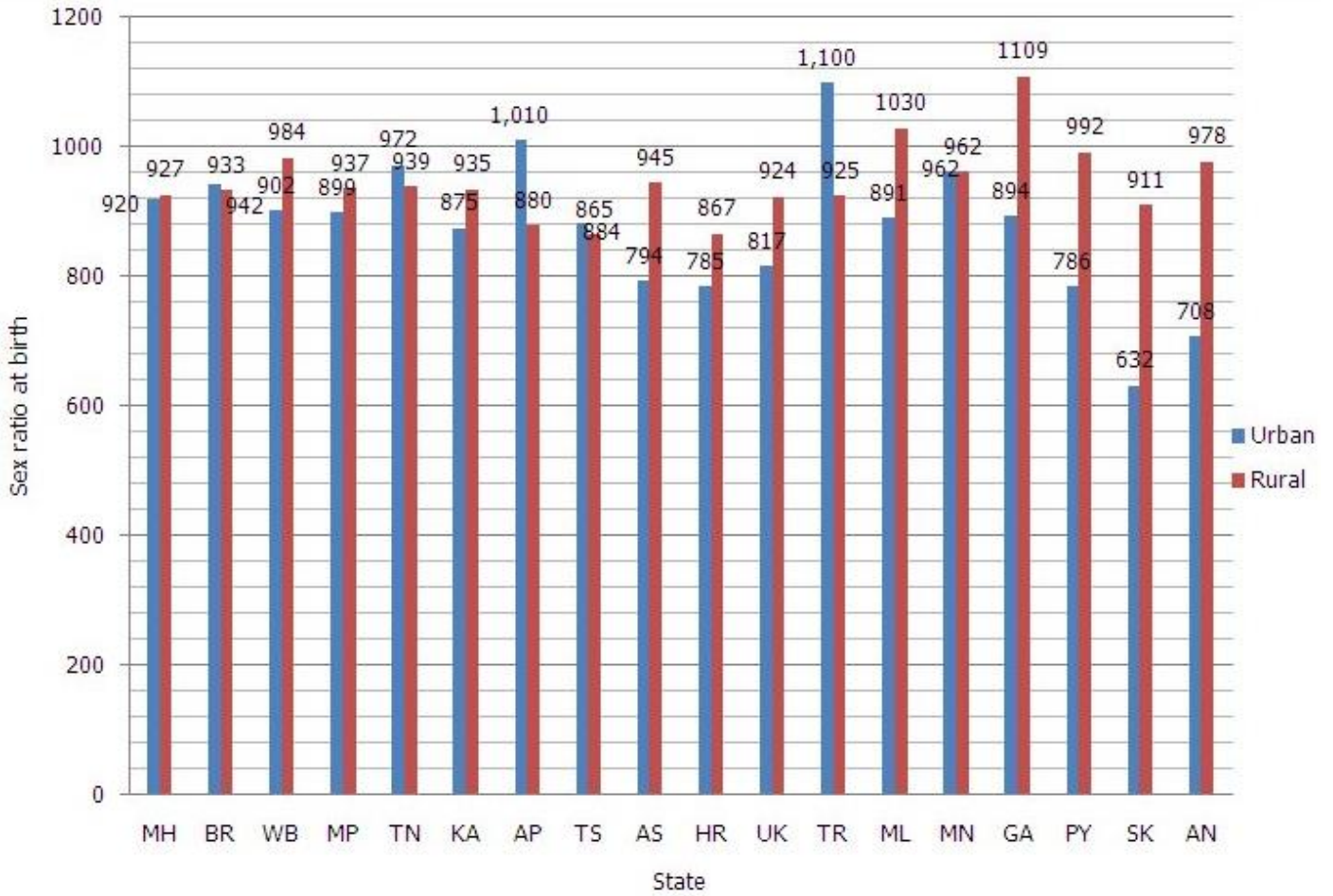
Figure 3: Distribution of states and UTs of India according to sex-ratio at birth in urban and rural areas