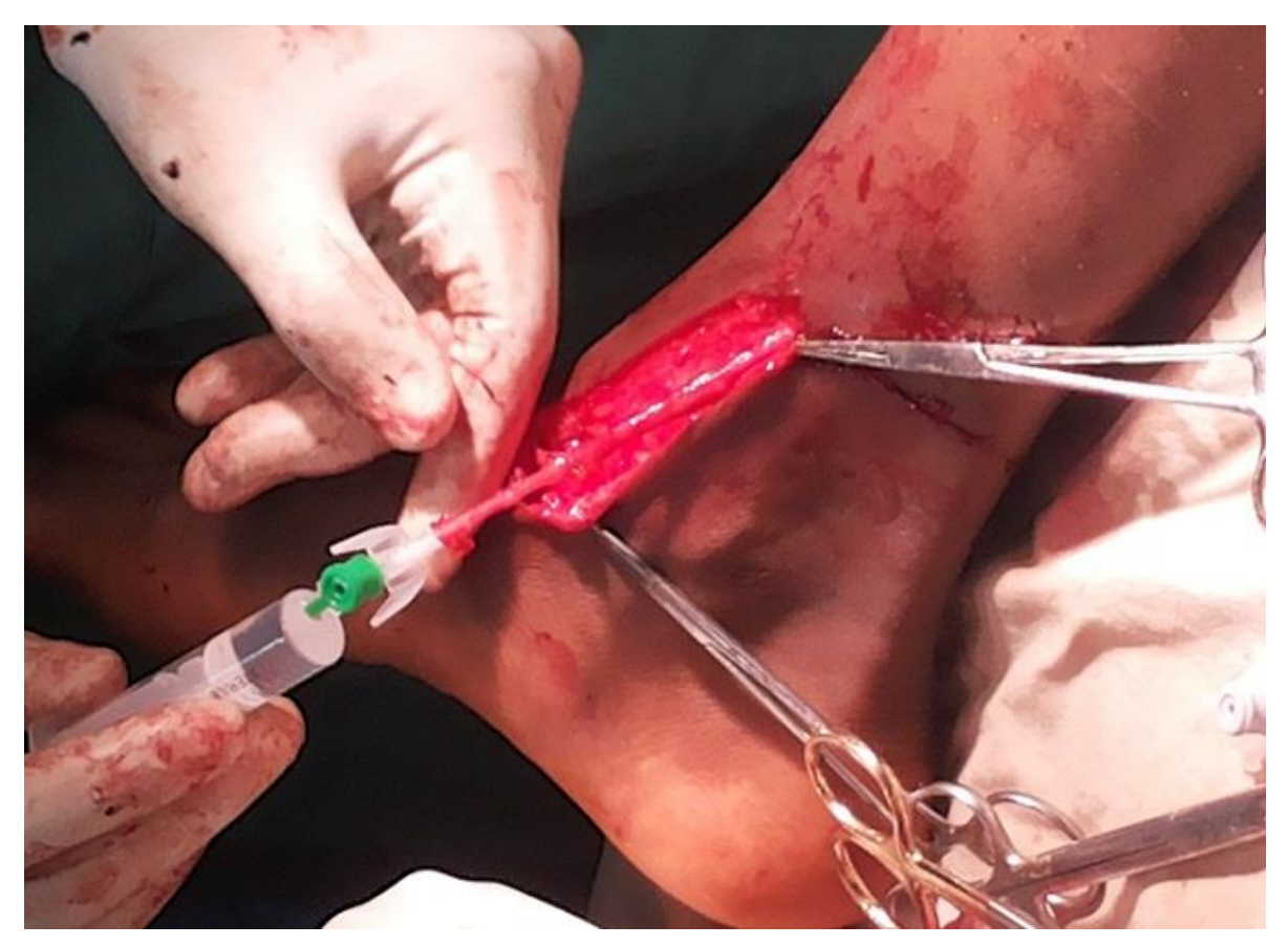
Figure 2: Greater saphaneous vein harvest