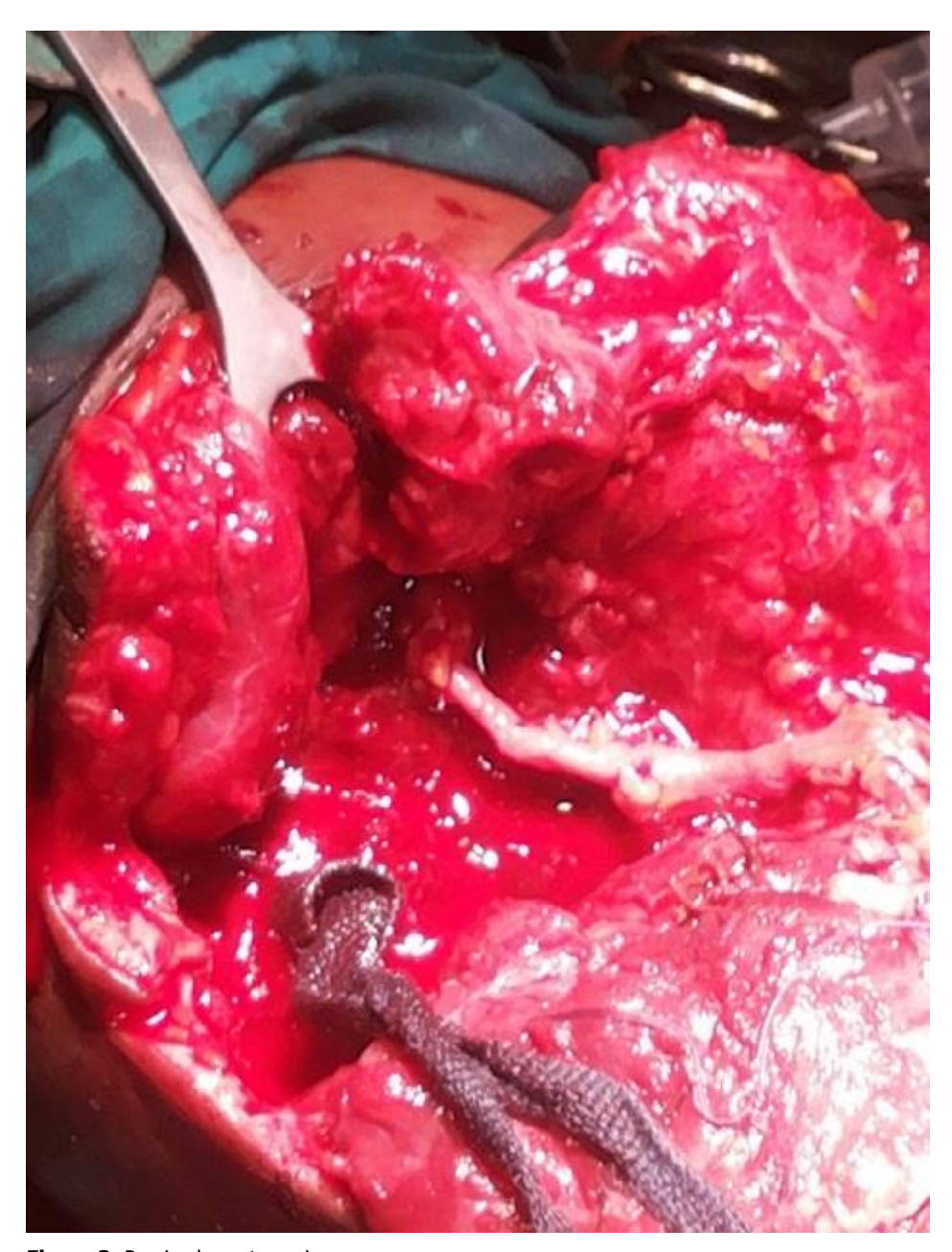
Figure 3: Proximal anastomosis