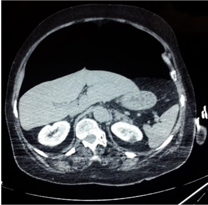
Figure 2: Thoraco-abdominal computed tomography scan performed one hour after the occurrence of the abdominal distension. It revealed a massive pneumoperitoneum, without intraperitoneal effusion, pneumothorax or pneumomediastinum