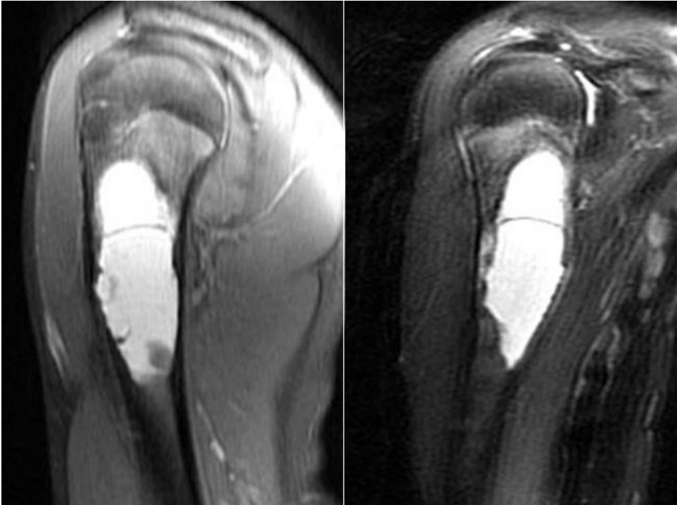
Figure 2: T2-weighted sagittal MRI depicting of the lesion