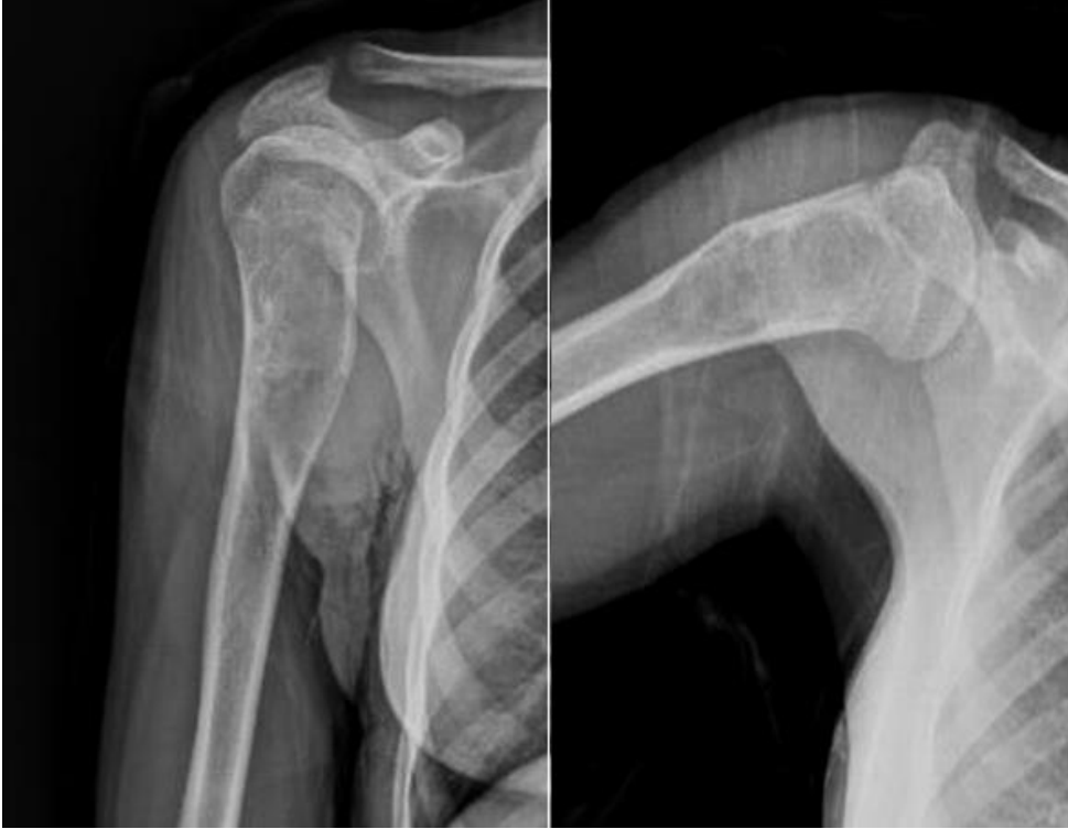
Figure 1: Radiography view of the simple bone cyst of the proximal humeral in 13 year old boy