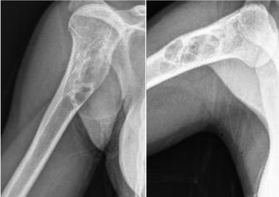
Figure 3: Radiography view of the tumour recurrence in one year after surgery