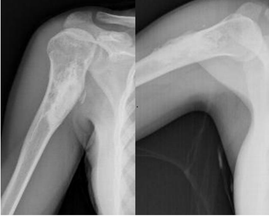
Figure 5: Complete healing after a second curettage and grafting procedure