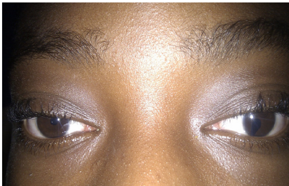
Figure 1: Iris coloboma of the left eye showing the classic keyhole-shaped defect