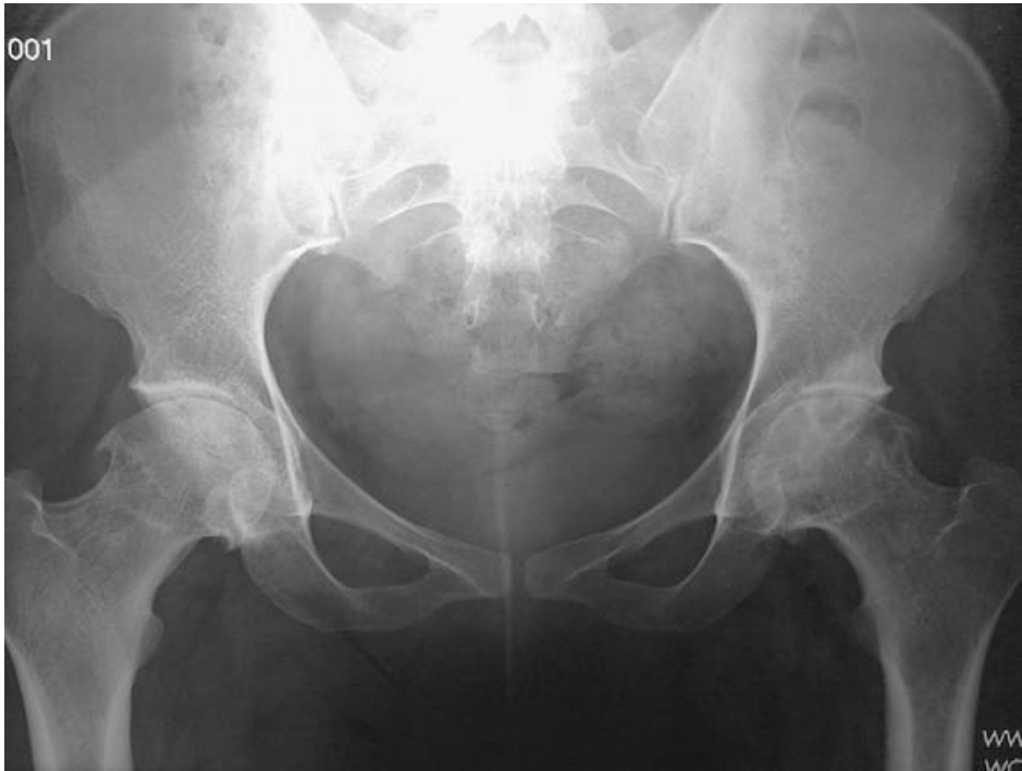
Figure 3: Prominent osteoarthritis, which is bilateral, with collapse of the articular surface and minimal loss of sphericity at the left femoral head