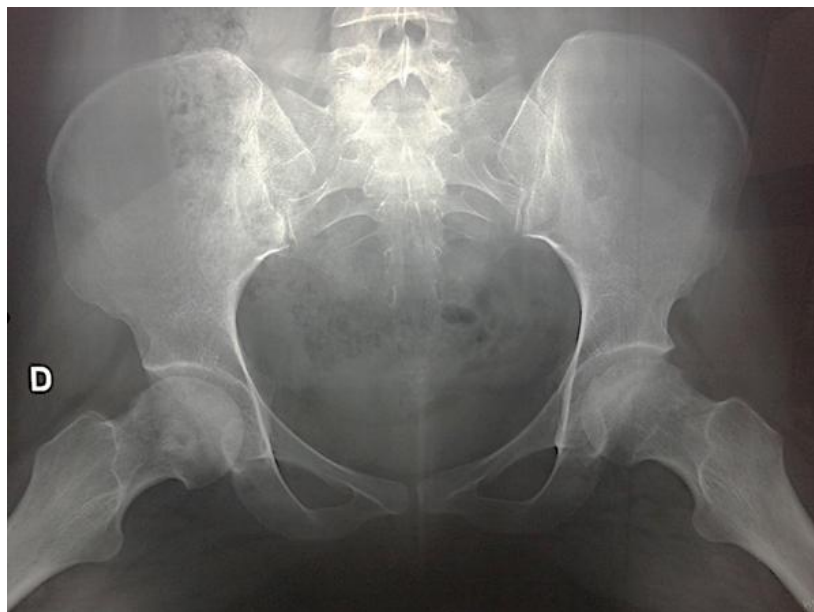
Figure 1: Left femoral heads subtle loss of sphericity