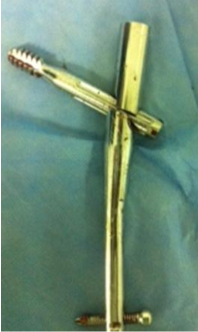
Figure 3: Fracture of gamma nail