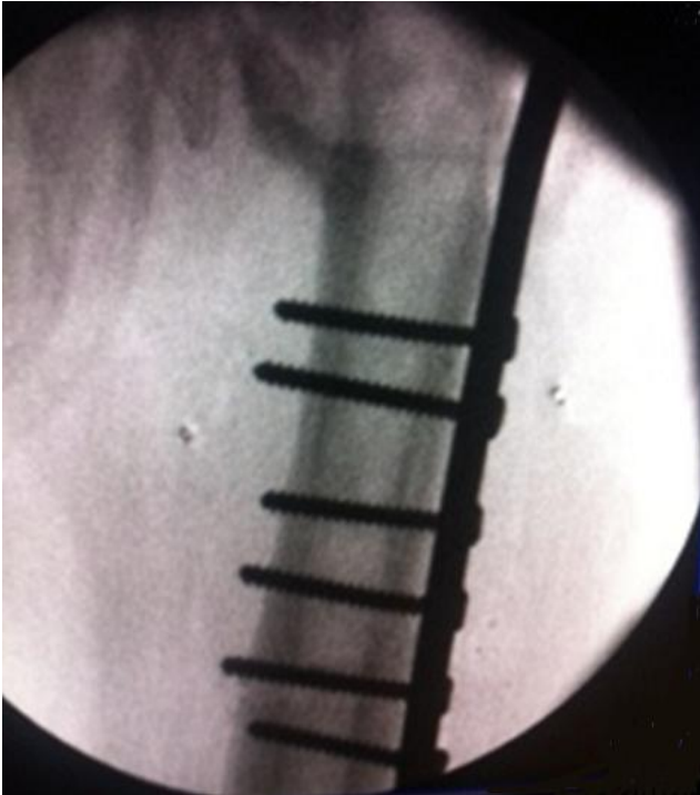
Figure 6: Intra-operative antero-posterior radiograph of the revision fixation