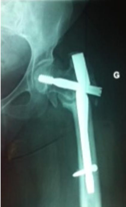
Figure 1: Antero-posterior radiograph of the left hip 6 months after stabilisation of peritrochanteric fracture with a gamma nail