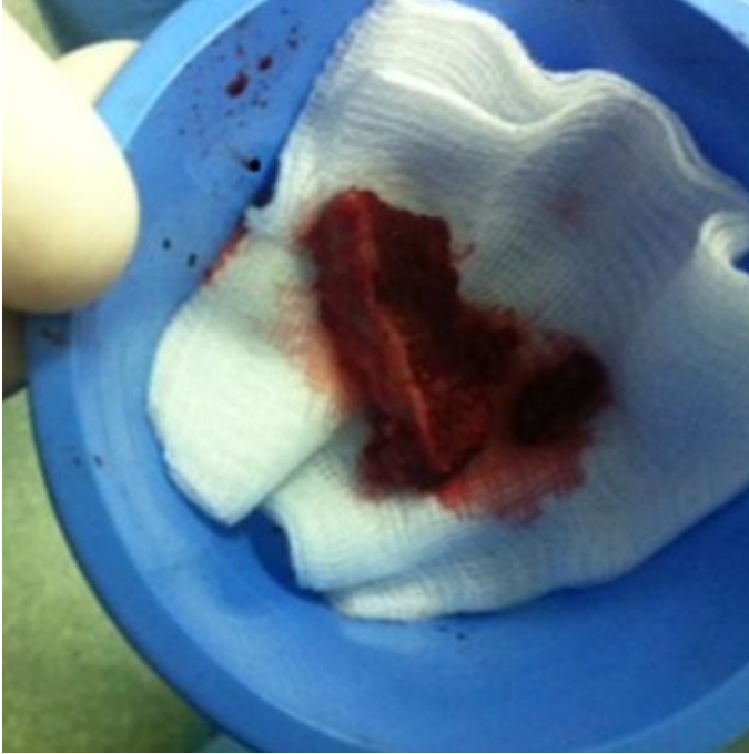
Figure 5: Bone graft levied from the iliac crest