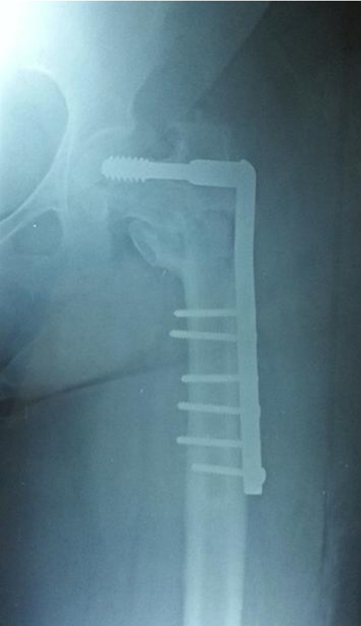
Figure 7: Antero-posterior radiograph of the left proximal femur showing the union of the fracture