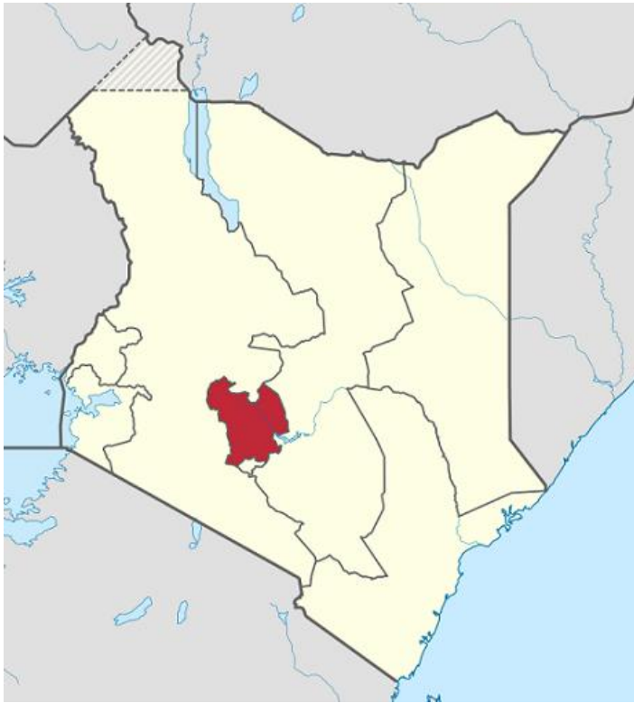
Figure 1: Map showing Central region, Kenya, 2009