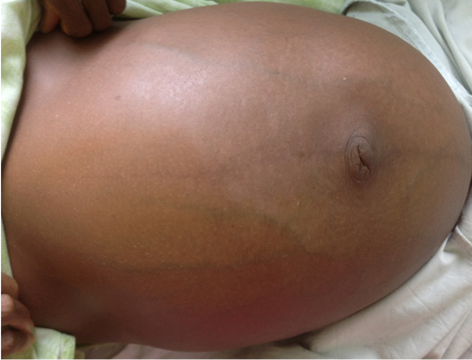
Figure 1: Showing massive hepatomegaly with distended veins and the pregnancy