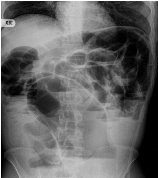
Figure 1: Plain upright abdominal X-ray showing dilated sigmoid colon and dilated small bowel with multiple air-fluid levels