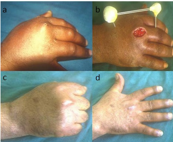
Figure 2: Arthritis stage 2 of the MP joint of the right middle finger (a), treated by excision and stabilization by Beaubourg's external fixator (b), provided healing with a good functional and aesthetic result (c, d)