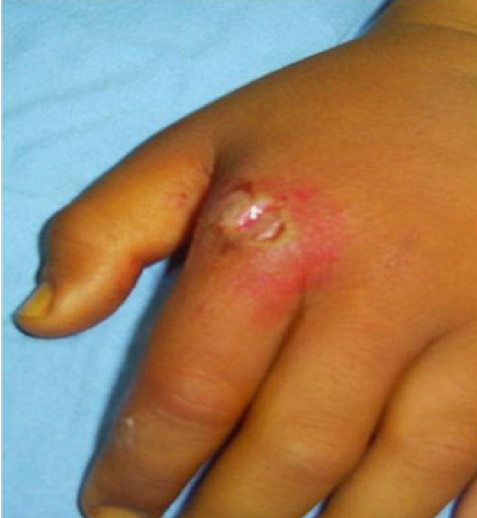
Figure 1: Infected wound on the dorsum of the left hand in front of the MP joint of the index following a fist against the teeth