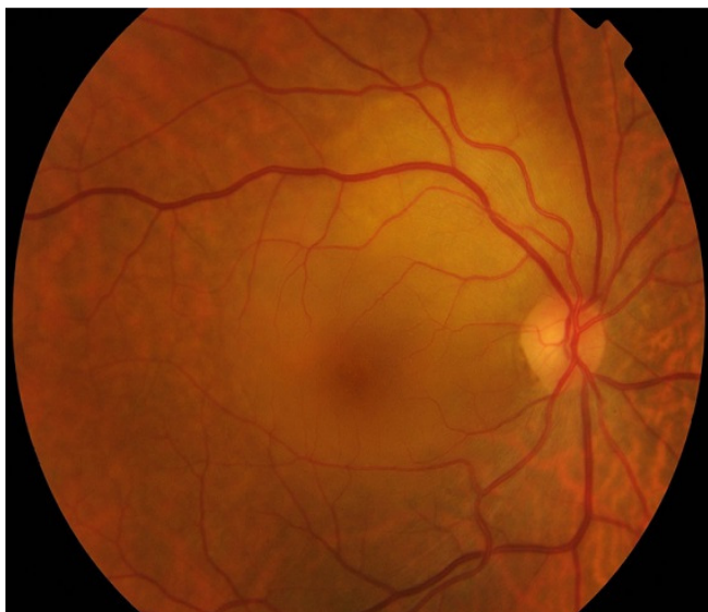
Figure 1: Color fundus photograph of the Right Eye (RE) showing a yellowish juxtapapillary subretinal mass with associated serous macular detachment