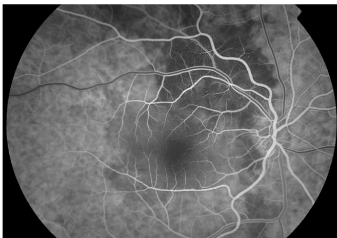
Figure 2: Fundus Fluorescein Angiography (FFA) of the RE, early frames, showing hypofluorescence of the mass as a result of transmission defect from the choroidal circulation