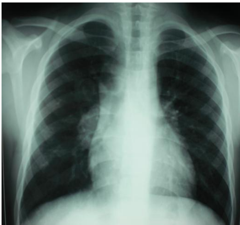
Figure 1: Chest radiography: superior mediastinal enlargement