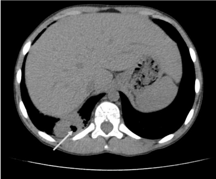
Figure 3: Chest computed tomography: cavitary pneumonia of right lower lobe