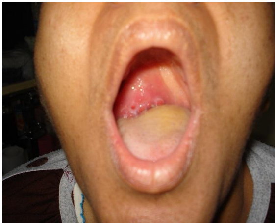
Figure 1: Lesion of mid part of palate, extending up to the posterior border of hard palate