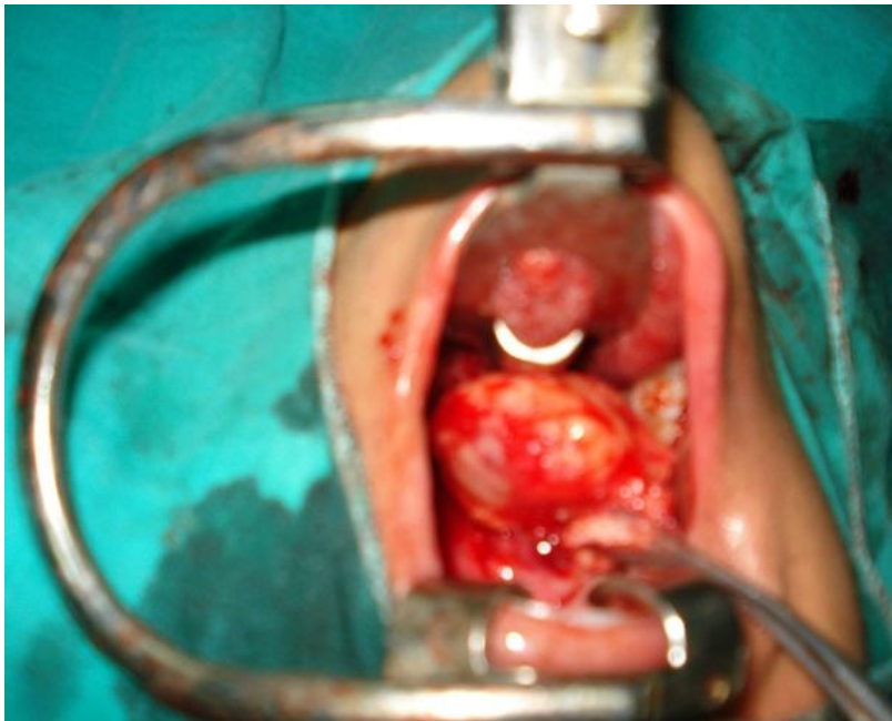
Figure 3: Surgical wound following tumor excision