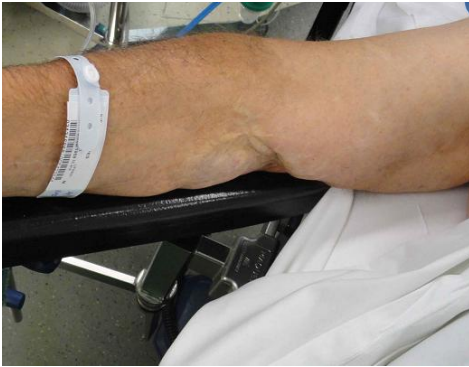
Figure 1: Deformed and amyotrophic right upper limb due to radial nerve palsy complicating humeral comminuted fracture