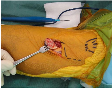
Figure 4: Single anterior approach of the elbow