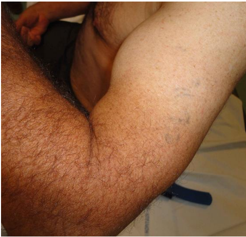
Figure 2: "Popeye's sign" pathognomonic of distal biceps tendon rupture