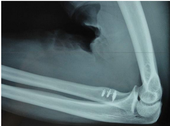
Figure 6: Lateral radiograph of the elbow showing trans-osseous anchors position