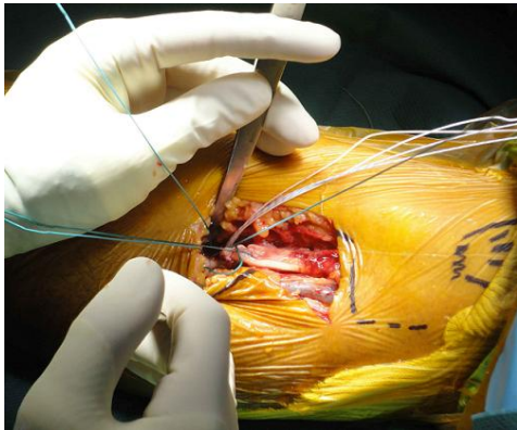
Figure 5: Trans-osseous anchoring of the distal biceps tendon in bicipital tuberosity