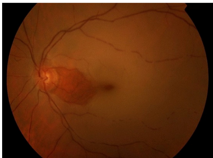
Figure 1: Colour fundus photograph of the left eye showing acute CRAO with cherry-red spot and cattle trucking of the arterioles