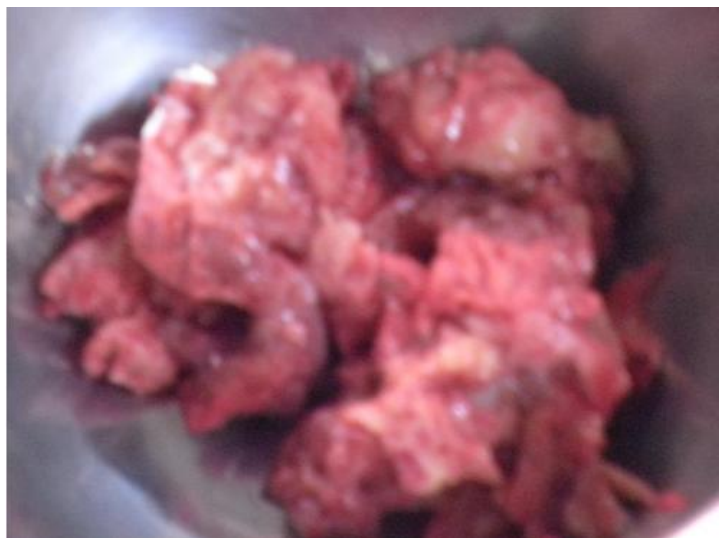
Figure 3: Photograph of the explanted tumor