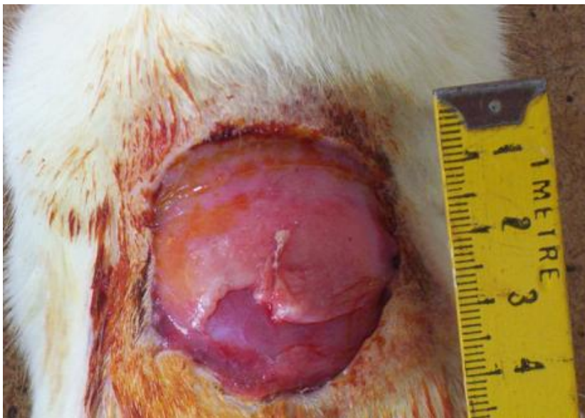
Figure 3: The skin defect in group 2 without suturing