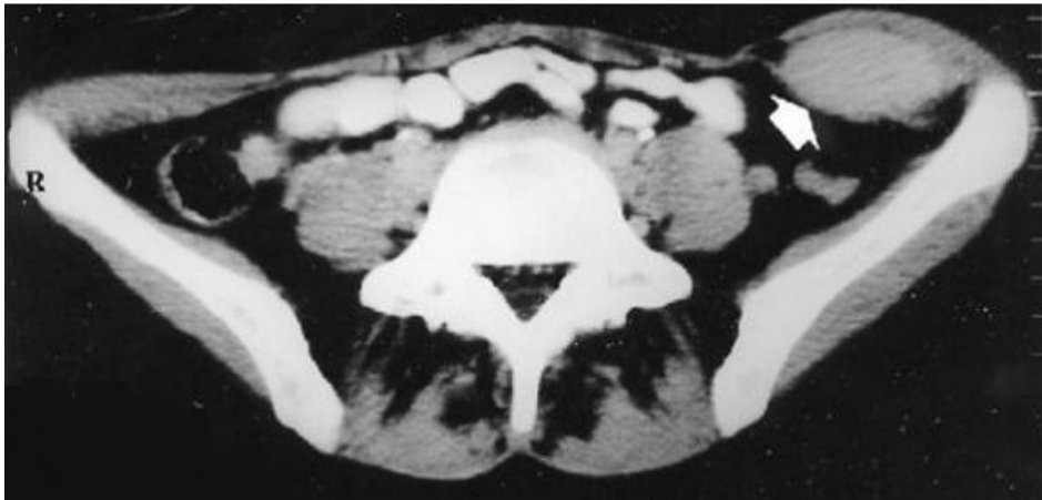
Figure 1: CT Scan of the patient demonstrating the tumour mass