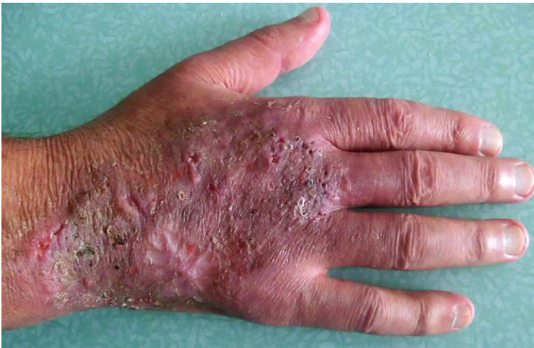
Figure 6: Early desinfiltration and healing in day 7 of treatment with regression of bubbles