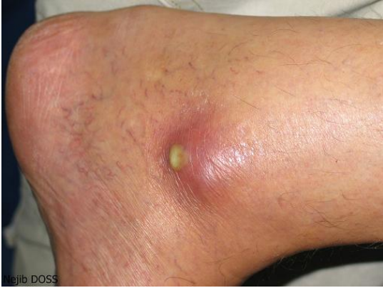
Figure 3: Infiltrated erythematous plaque of the left ankle surmounted by a large pustule