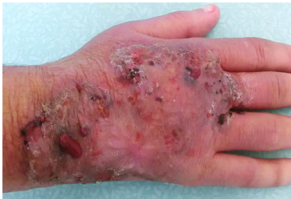
Figure 1: Erythematous plaque with vesicular bubbles, elevated edge, interesting the back of the right hand and wrist