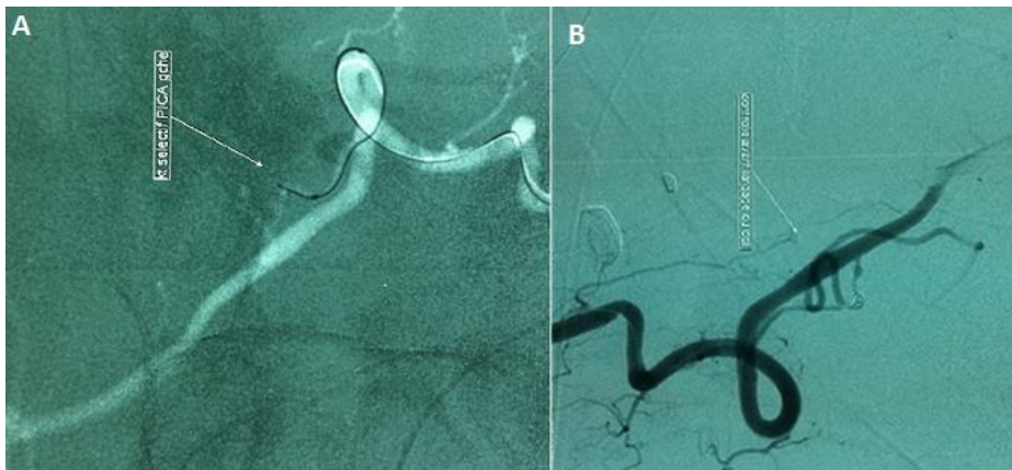
Figure 2: (A) MRA: angiographic embolization with microspheres of the aneurysm; (B): postembolization angiography