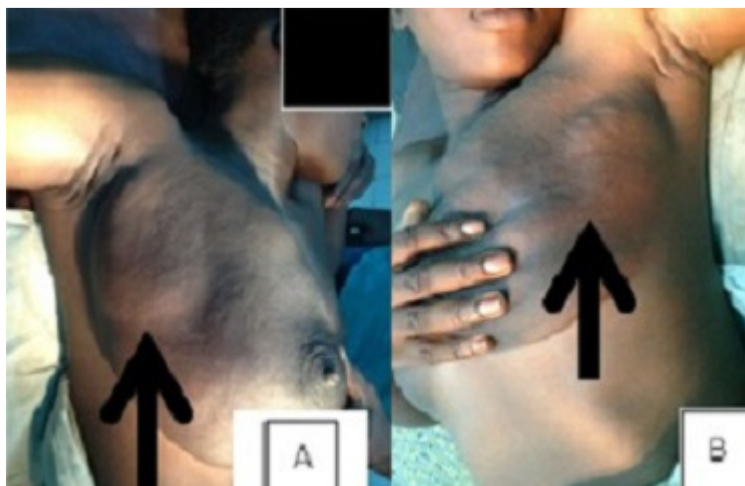
Figure 1: (A) appearance of bilateral gigantomastia associated with lumps (arrows) in the right; (B) left breasts