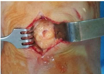
Figure 4: Open resection of Hoffa's fat pad