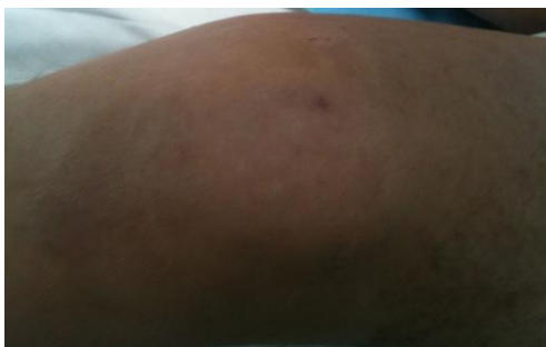
Figure 1: Chronic knee pain, mild anterior swelling and mild loss of knee extension