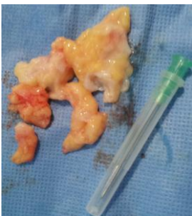
Figure 5: Excised Hoffa's fat pad in arthroscopy