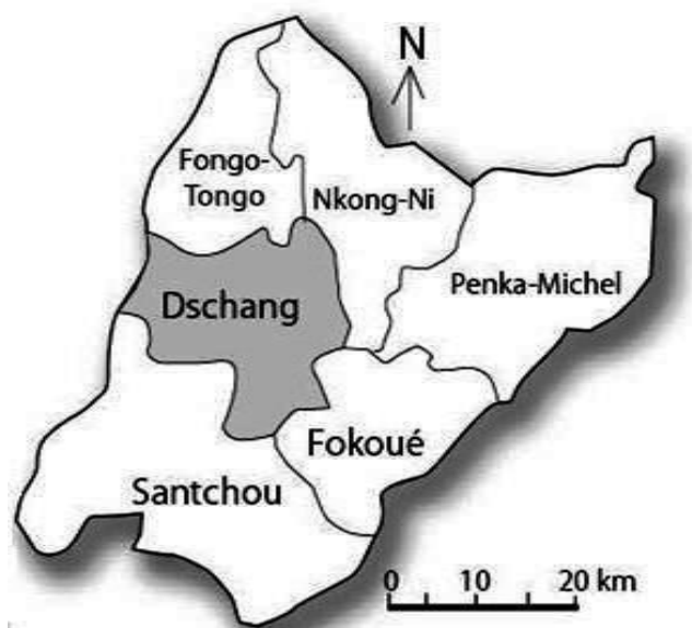
Figure 1: Height measurement [31]