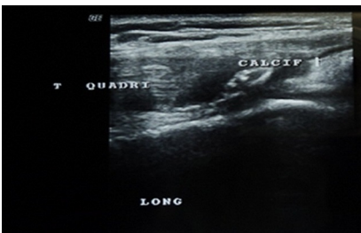
Figure 3: Ultrasound showing rupture of the quadriceps tendon with calcifications