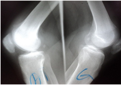
Figure 2: Lateral radiographs showing suprapatellar calcifications