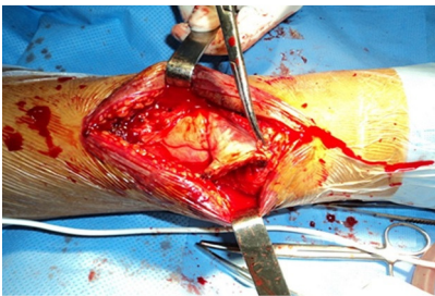
Figure 5: Operative view of V/Y CODIVILLA plasty