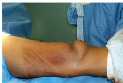
Figure 1: Suprapatellar defect on the right knee

Figure 5: Operative view of V/Y CODIVILLA plasty