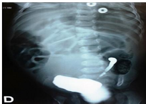
Figure 2: vesicoureteral reflux on a blind ending ureter