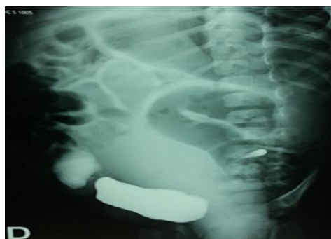
Figure 1: cystography objective pelvic cystic mass communicating with the bladder