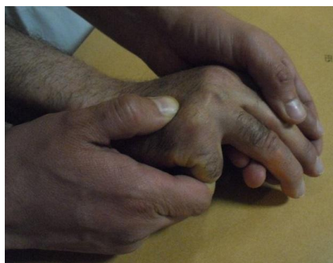
Figure 1: Jahss maneuver