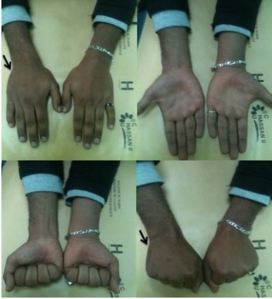
Figure 6: examination shows perfect healing of the fracture without malrotation or volar angulation of the metacarpal head and a good functional results at 1 year followed-up of the same patient as show in Figure 4, Figure 5