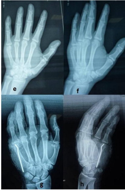
Figure 4: (e,f): Radiograph of a 28 years old male patient with displaced little finger metacarpal neck fracture; (g,h): Postoperative radiograph of the same patient treated with intramedullary nailing