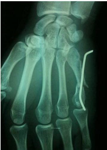
Figure 7: one case as the wire had backed out losing the reduction at the fracture site